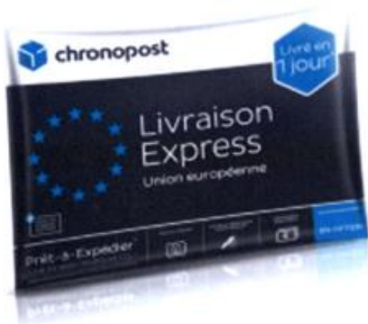
Enveloppe CHRONOPOST “Union Europeenne” 2Kg

Applicants from Portugal and the Azores are required to bring to their visa interview a Chronopost envelope size 2kg for “European Union.” This envelope can ONLY be purchased at a French Post Office. Below is a map and directions to the French Post Office that is nearest to the U.S. Embassy in Paris.